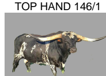
TOP HAND 146/1