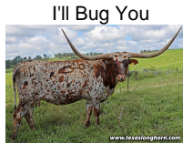
I'll Bug You