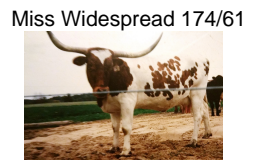
Miss Widespread 174/61