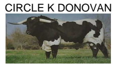
CIRCLE K DONOVAN